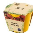
Tomato seed kit