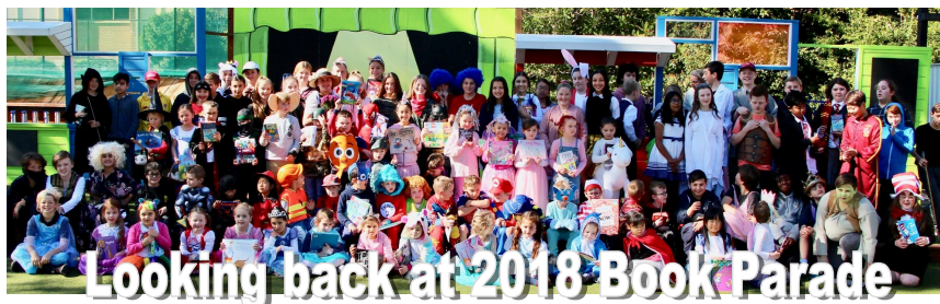
Looking back at 2018 Book Parade

Please do not go to any expense. Most children have a costume at home eg. Fairy, witch, wizard, a DC or Marvel superhero, if not many characters costumes are easily in the children's wardrobe eg. Mary Poppins, Matilda, Hey Jack, Zac Power who wear normal clothes. The book parade will be at 10.00am on the Primary playground followed by rug reading (have you contacted your child's teacher to read a short story?) followed by a picnic morning tea. Hope you can join us!