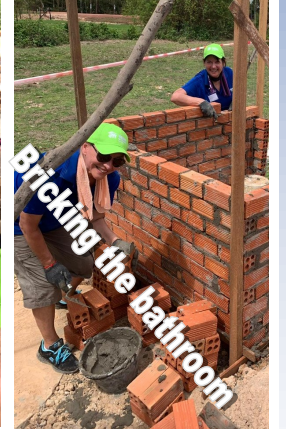
Bricking the bathroom