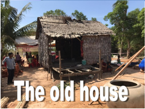
The old house