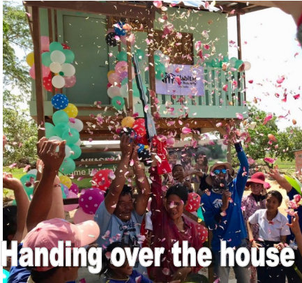
Handing over the house