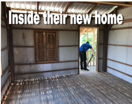
Inside their new home