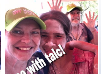
dance with talc!