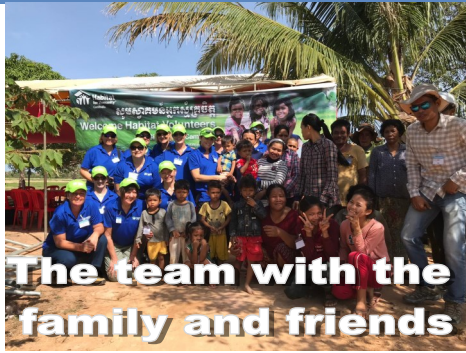
The team with the family and friends