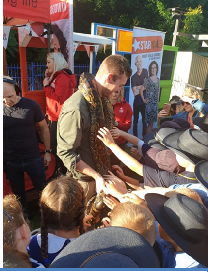
GREAT MORNING WITH STAR FM THE REPTILE PARK AND THANKS TO BENDIGO BANK FOR THE $500