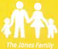
The Jones Family

A percentage of every transaction goes straight back to your school, to reinvest in important initiatives.